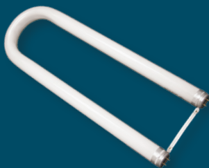
U-Bend Fluorescent Lamp