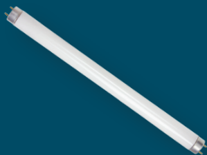
T8/T12 Fluorescent Lamp