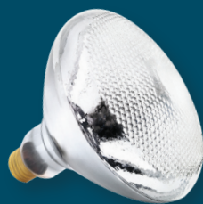
PAR 30/38 Halogen Bulb

If you recognize any of these lights, your business could benefit from a retrofit. Your contractor can help you choose the best replacements for your needs.