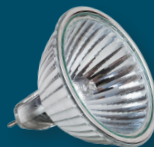
MR16 Halogen Bulb